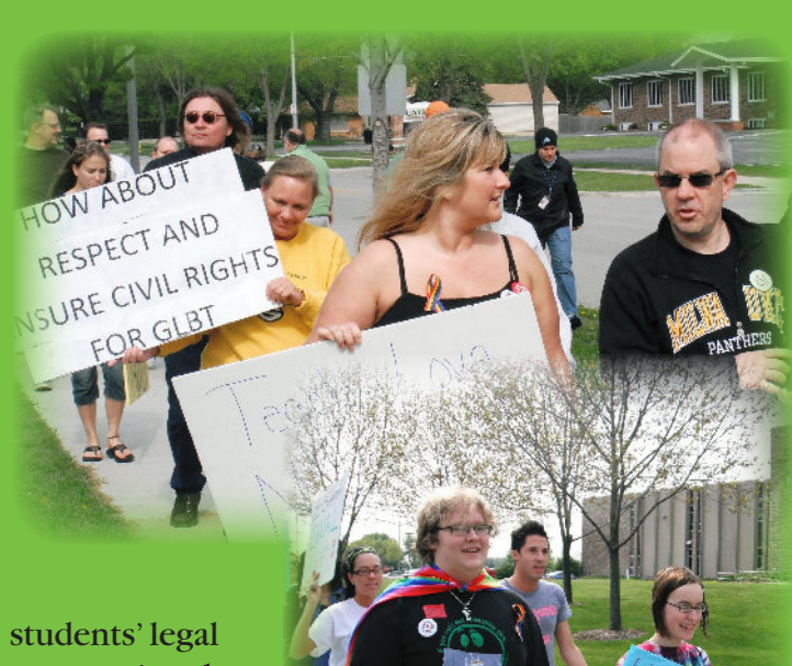
Students and staff at West Bend High School rally in front of their school to encourage their school board to grant official recognition for their GSA. GSAFE staff regularly work with schools and communities like West Bend to ensure students' legal right to a GSA is recognized.