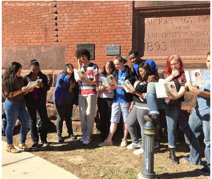
Foundations of Leadership Students