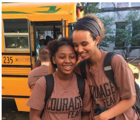
Foundations of Leadership.