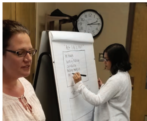
Gender Inclusive Schools. Photo credit: Brian Juchems