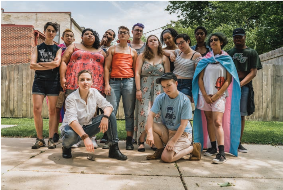
Adult Mentors - Leadership Training Institute.