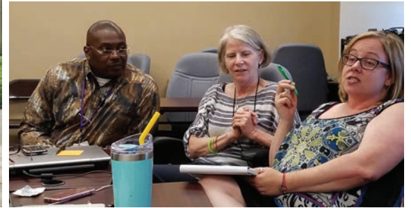
Top: Foundations of Leadership. Bottom: Gender Inclusive Schools.