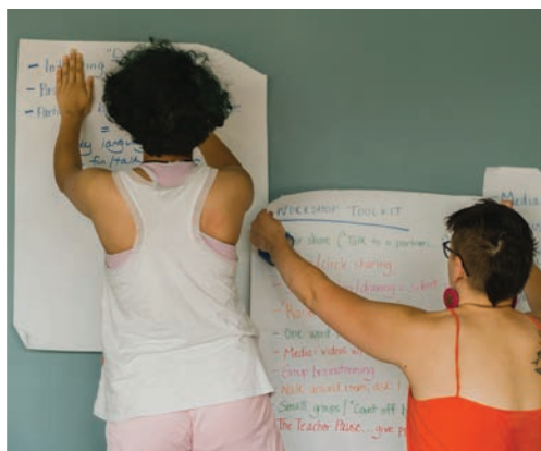
Leadership Training Institute.